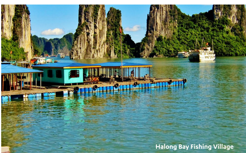
Halong Bay Fishing Village