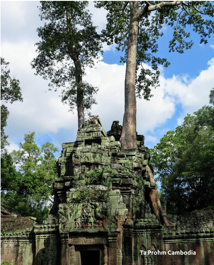
Ta Prohm Cambodia