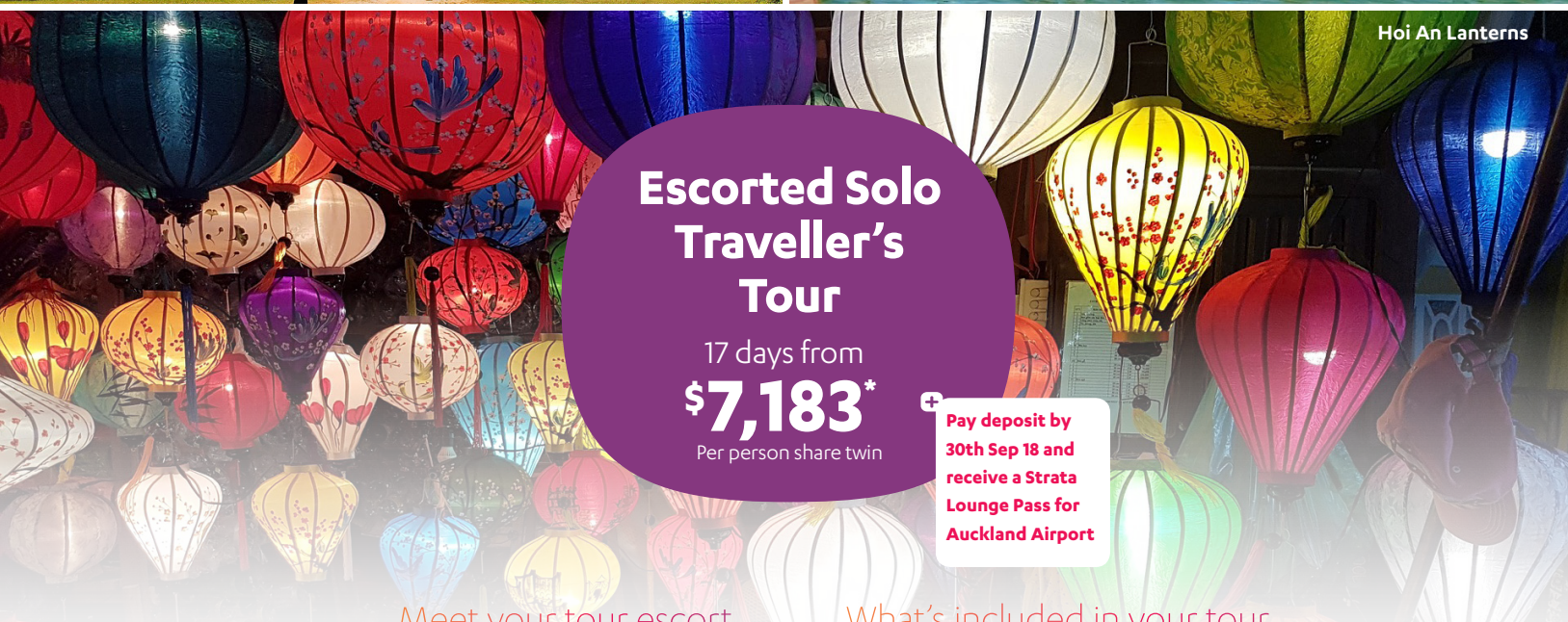
Hoi An Lanterns