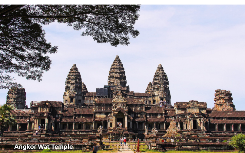
Angkor Wat Temple