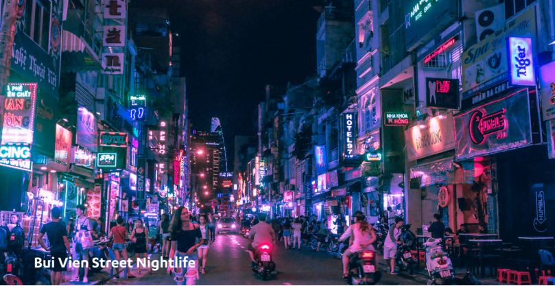
Bui Vien Street Nightlife